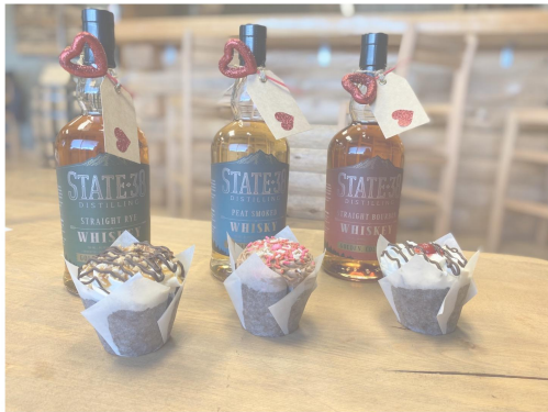
WhiskeyGrams from State 38 Distilling and Gold Mine Cupcakes.