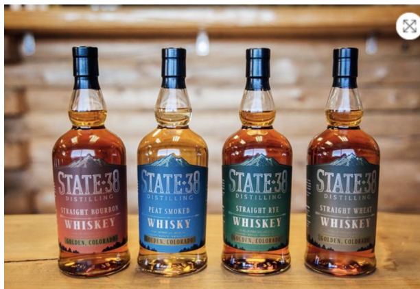
New bottles and whiskey varieties from State 38 Distilling.

LINNEA COVINGTON | JANUARY 29, 2021 | 10:59AM