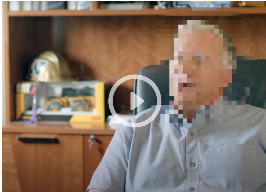
Stop Crimes Against Your Bottom Line

THE UNIQUE CAMPAIGN CONSISTED OF FIVE TOTAL VIDEOS