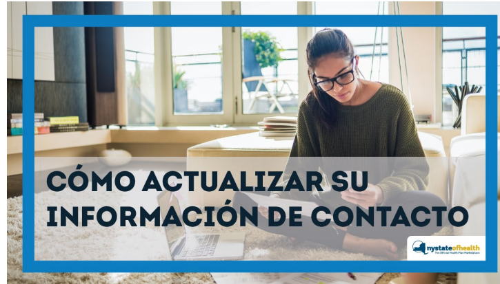
How To Update Your Contact Information