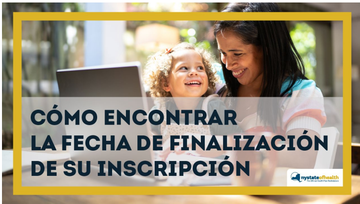
How To Find Your Enrollment End Date