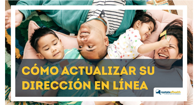
How To Update Your Address Online