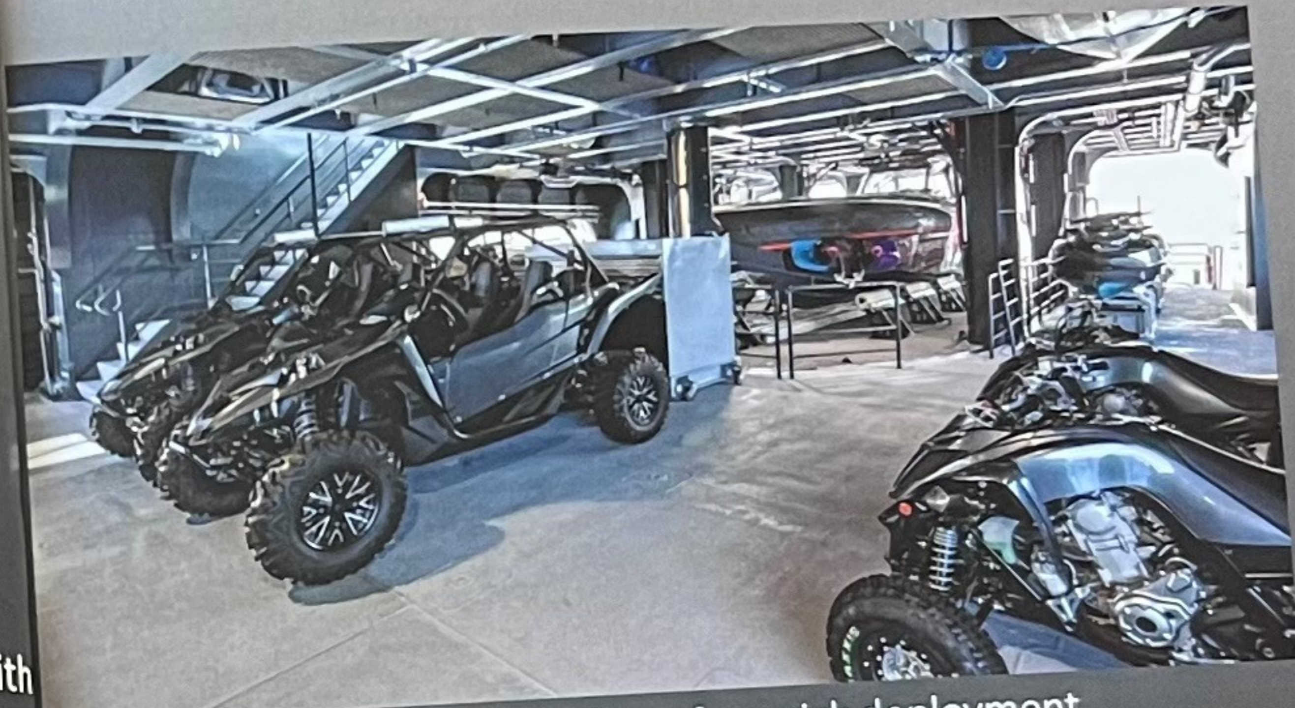
Plentiful storage plus Lift Platform for quick deployment