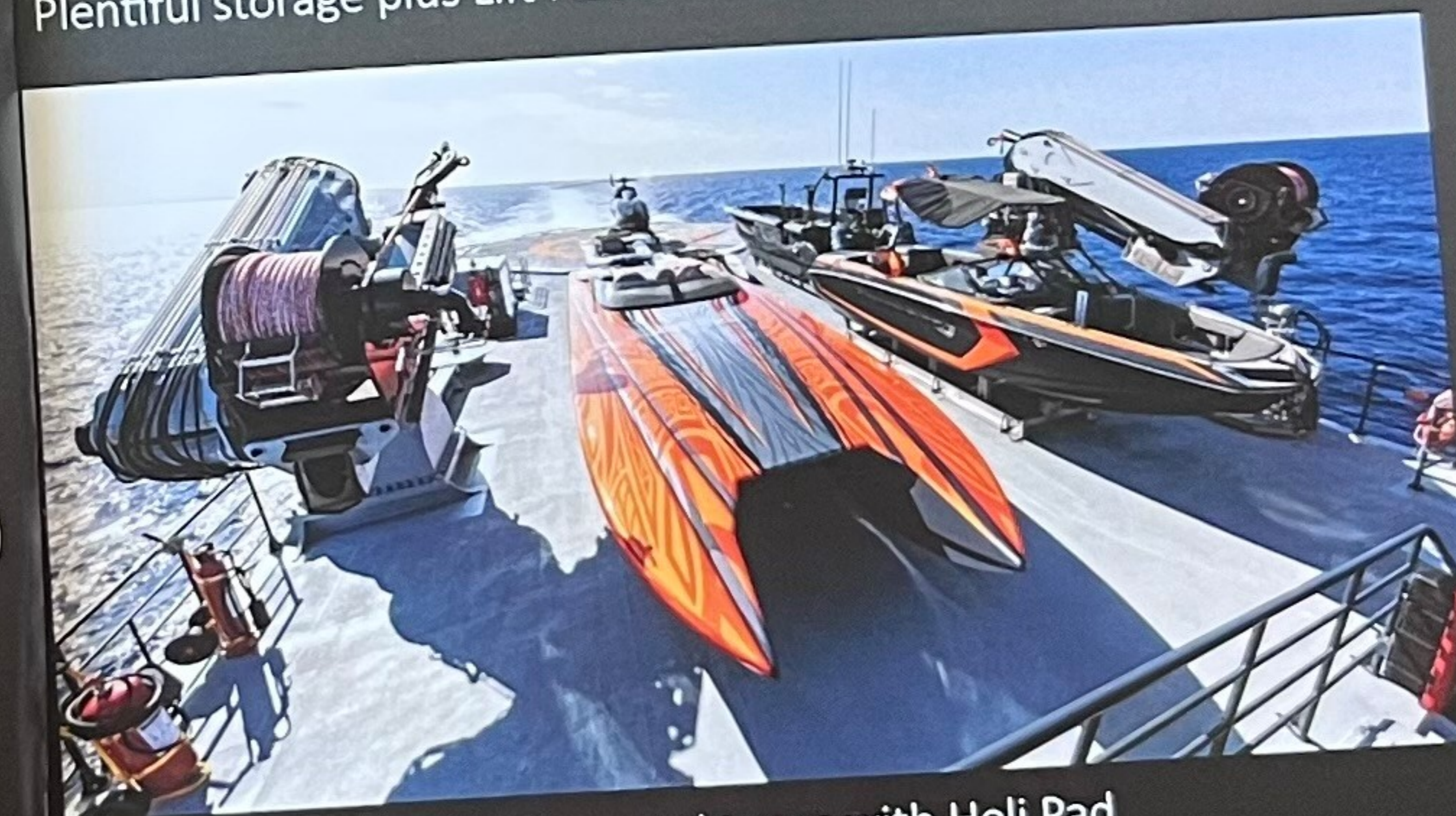
Deck space for multiple vessel types with Heli Pad