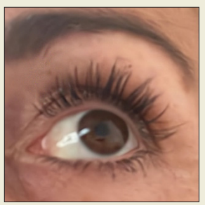
*Before and After photos above taken four weeks apart.